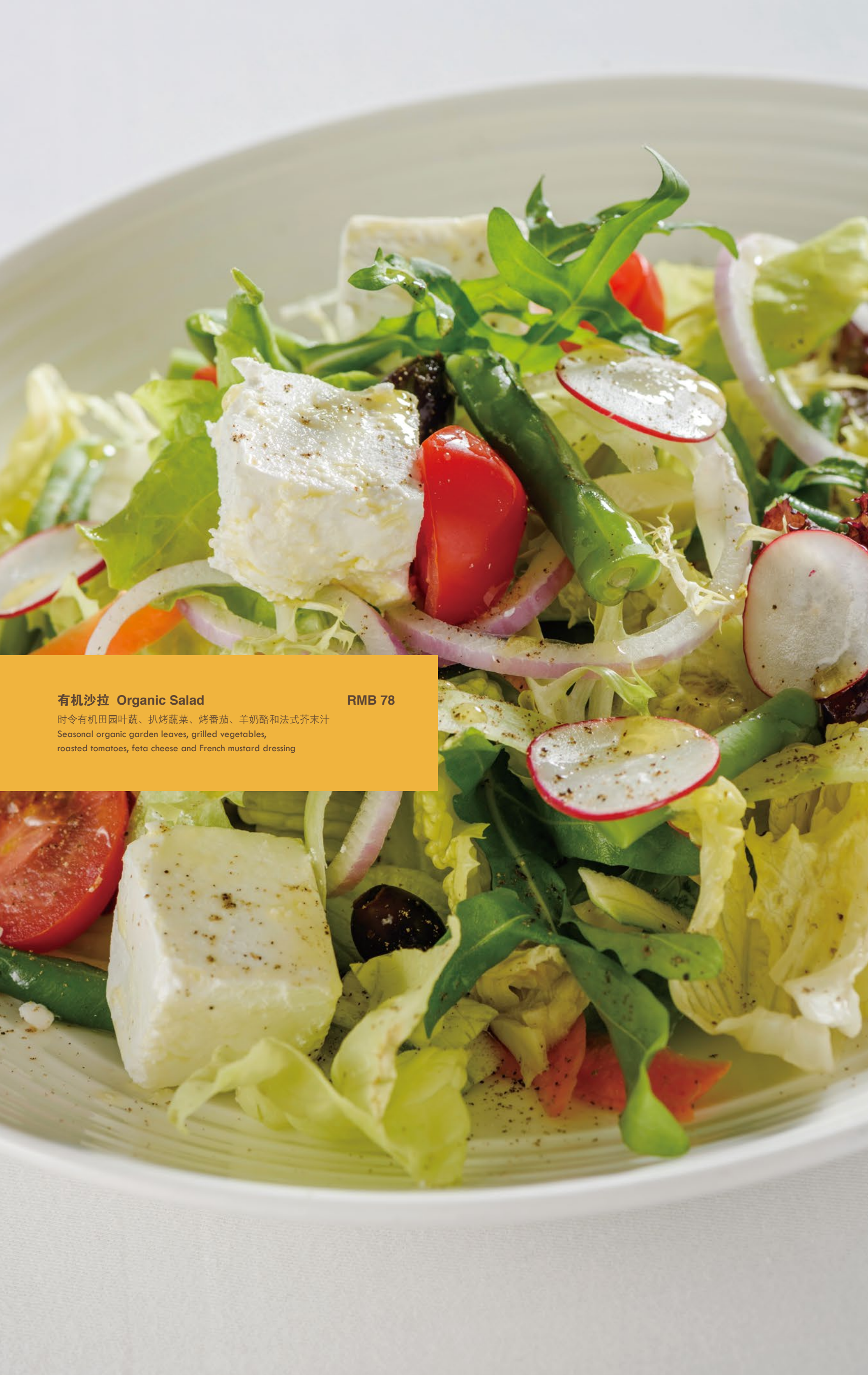
有机沙拉 Organic Salad RMB 78 时令有机田园叶蔬、扒烤蔬菜、烤番茄、羊奶酪和法式芥末汁 Seasonal organic garden leaves, grilled vegetables, roasted tomatoes, feta cheese and French mustard dressing