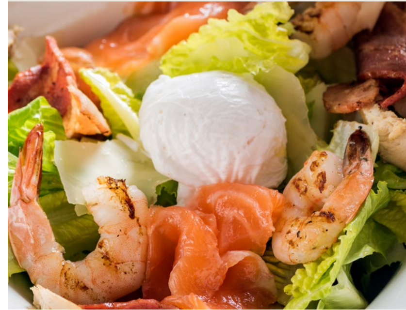
凯撒沙拉 Caesar Salad RMB 108 罗马生菜、脆培根、帕玛森奶酪、香蒜面包、白煮蛋、凤尾鱼和凯撒汁 Romaine lettuce, crispy bacon, parmesan shavings, garlic croutons, poached egg, anchovies and caesar dressing. 外加扒大虾 add grilled prawns RMB 20 外加扒鸡肉 add grilled chicken RMB 10 外加烟熏三文鱼 add smoked salmon RMB 20