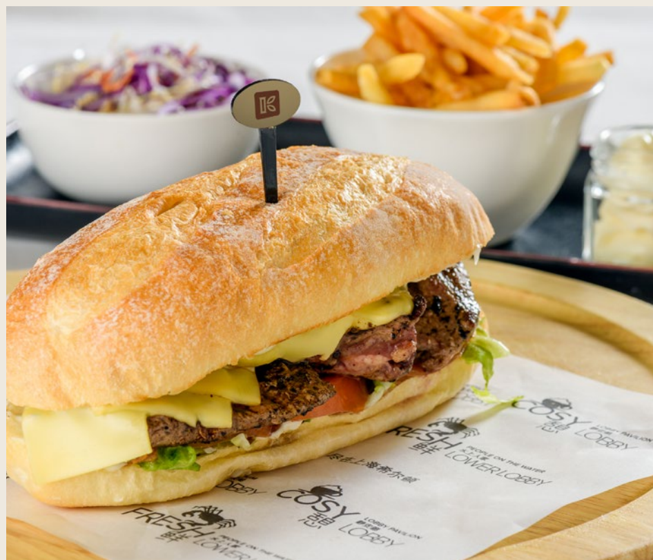
牛扒三文治 RMB 148 Steak Sandwich

扒牛里脊、芝麻叶、番茄片、车达奶酪、炒洋葱和烤蒜蛋黄酱及迷你法棍面包 Grilled beef tenderloin, arugula leaves, sliced tomatoes, cheddar cheese, caramelized onions and roasted garlic aioli served on a mini baguette