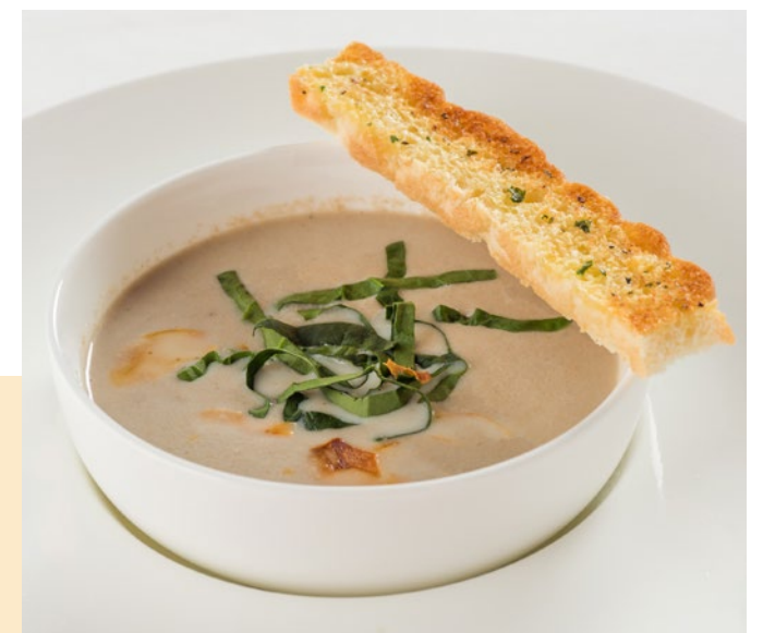
蘑菇汤 Mushroom Soup RMB 78 新鲜蘑菇配烤蒜、黑菌油和菠菜 Fresh mushrooms with roasted garlic, thyme & spinach