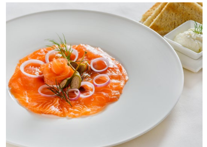
烟熏三文鱼 Smoked Salmon RMB 148 自制烟熏大西洋三文鱼配酸奶油、刺山柑、红洋葱和全麦吐司 Home-smoked Atlantic salmon, served with sour cream, capers, red onions and whole wheat toasted bread